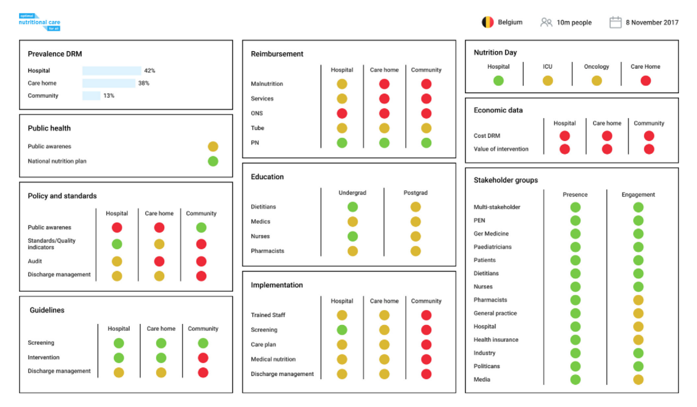
Fig. 3. Example of a country (Belgium) dashboard that is updated annually. Green: optimal situation, Orange: improvement underway, Red: improvements/corrections needed.

These outcomes demonstrate the importance of comprehensive national plans including the support of or delegated by the government which is in various stages of development in the 18 ONCA countries.